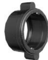
Winged Coupling Ring W/4482